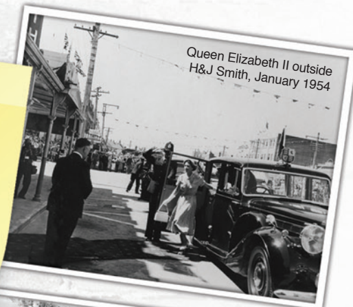
Queen Elizabeth II outside H&J Smith, January 1954