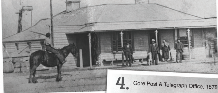
4. Gore Post & Telegraph Office, 1878