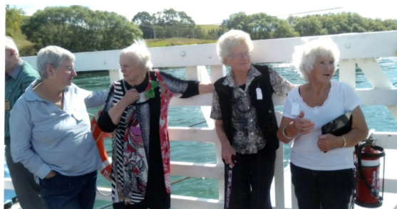
On the Tuapeka Mouth punt

A topical quiz was enjoyed on the home journey. Back through Waipahi, and our travelling circle was completed when we crossed the Gore Bridge again.