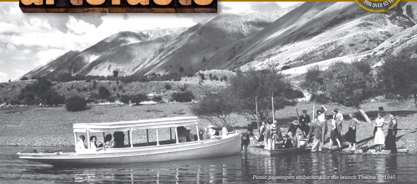
Picnic passengers embarking for the launch Thelma - c1940.