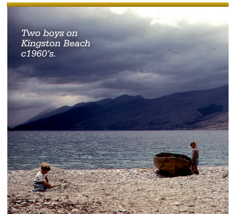
Two boys on Kingston Beach c1960's.